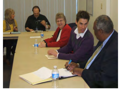
The Agency Advisory Council deals with issues that affect all agencies.

The newly formed Mid-South Food Bank Agency Advisory Council is comprised of a diverse group of representatives of Food Bank member agencies from all over the service area. The Council will serve as a link between Mid-South Food Bank and its member agencies and will work to enhance the quality of services provided by Mid-South Food Bank to its member agencies. It will provide a forum for sharing ideas, successes and challenges. The Council will develop opportunities for networking and learning from other agencies.